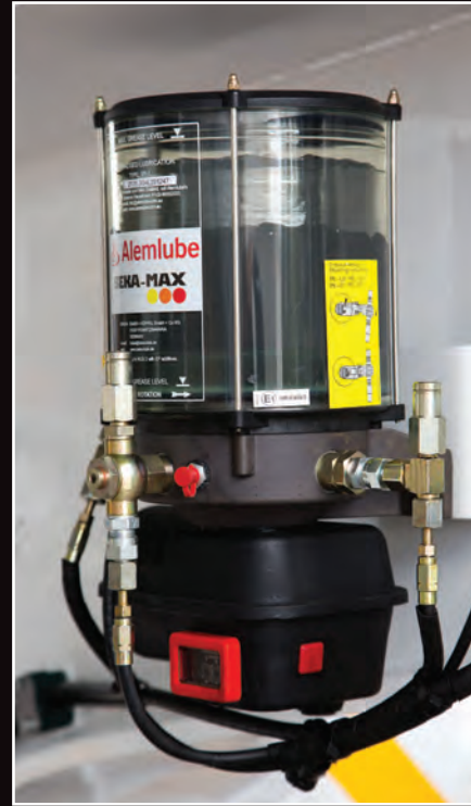
AUTO GREASING SYSTEMS