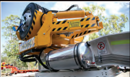
DRAKE TYRE CADDY