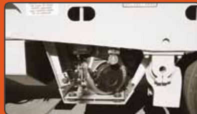
6HP ELECTRIC START DIESEL POWER PACK