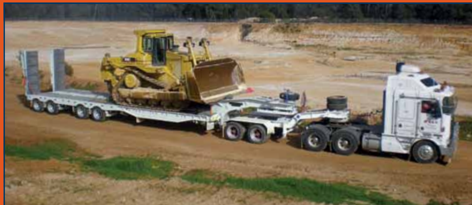
DRAKE 2 x 4 DOLLY AND 4 x 4 LEVEL DECK