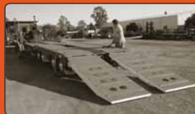
STANDARD REAR RAMPS IN LOWERED POSITION