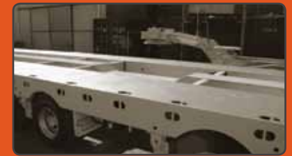
HYDRAULIC WIDENING FROM 2.5M TO 3.6M