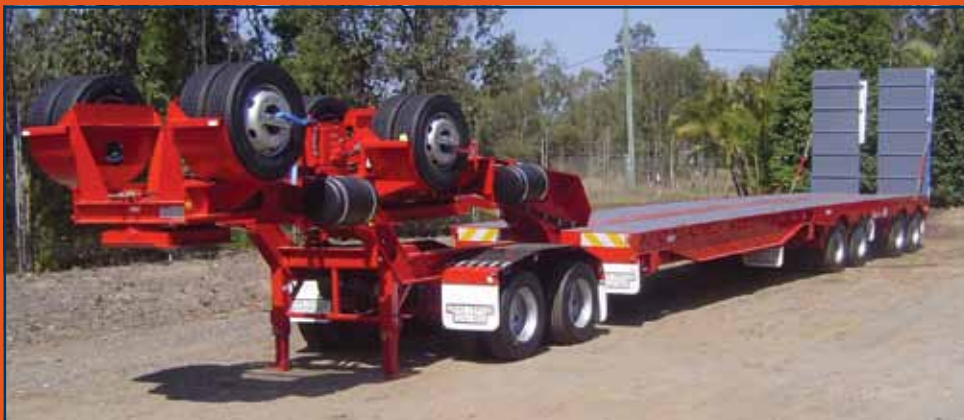
DRAKE 2 x 4 DOLLY AND 4 x 4 LEVEL DECK