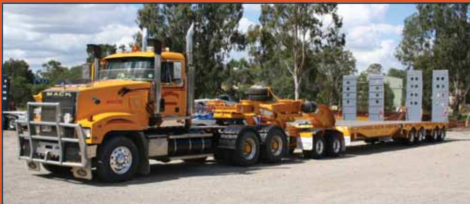
DRAKE 2 x 4 DOLLY AND 4 x 4 LEVEL DECK