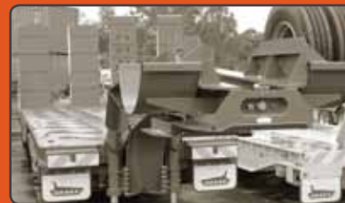
VERTICAL SPARE TYRE ARRANGEMENT