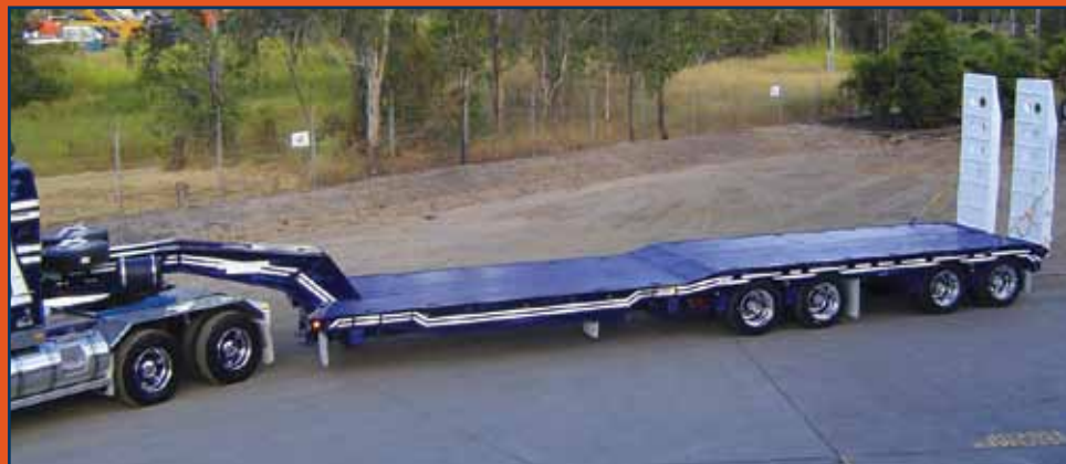
DRAKE 4 x 4 DROP DECK