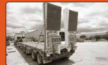
DOUBLE HUNG REAR RAMPS IN TRAVEL POSITION