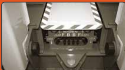
HYDRAULIC WIDENING AND LOCKING SYSTEM