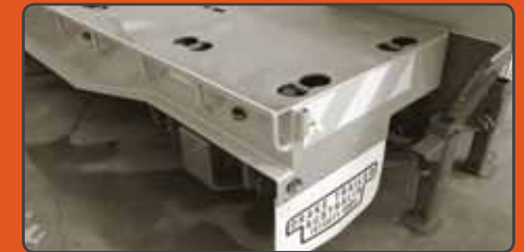
DROP DOWN LEGS AND TIE DOWN POINTS